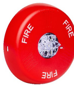
Model SL2SCR-F Strobe