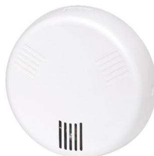
Model SL2HCW-N Horn

The Model `SL2HC'-series horn appliances work in either 12V or 24VDC, whereas the Series `SL2SC' and `SL2HSC' strobe and horn-strobe devices are specifically designed for 24V operation. The `SL2'-series is apt for indoor, ceiling-mount applications.