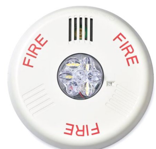
Model SL2HSCW-F Horn-Strobe