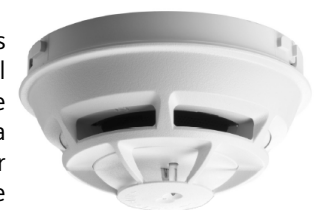
Model FDOT421 Multi-Criteria Fire Detector

The signal processing with detection algorithms allows the detector to first gather smoke and thermal data, and then analyze this information in the detector's 'neural network.' By comparing data received with the common characteristics of fires or fire signatures, Model FDOT421 can compare these signals to those of deceptive phenomena that cause other detectors to trigger a false alarm.